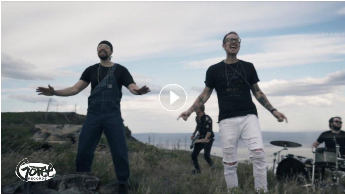
Official music video for "Love Like Thunder"