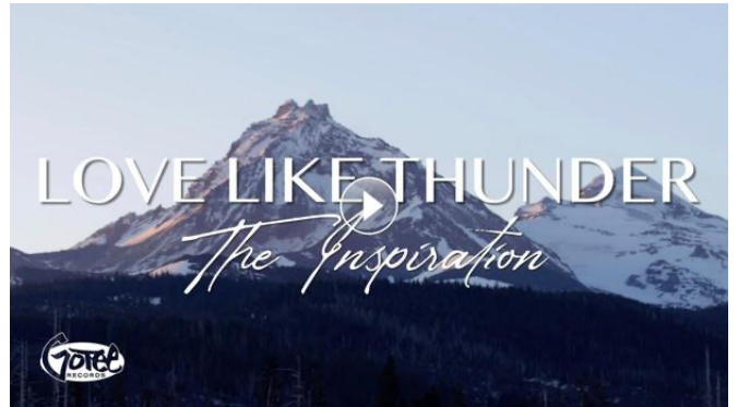
The story behind "Love Like Thunder"