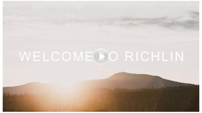
Welcome to RICHLIN