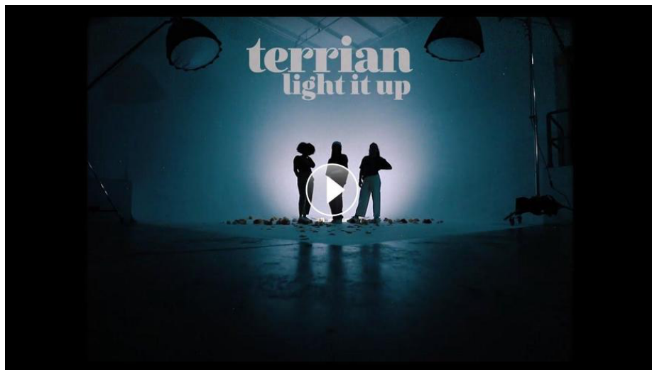
Official video for "Light It Up"