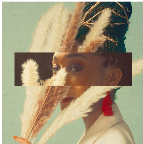
Album cover for Give It Time , download here

FULL-LENGTH DEBUT, GIVE IT TIME , RELEASING JANUARY 26TH